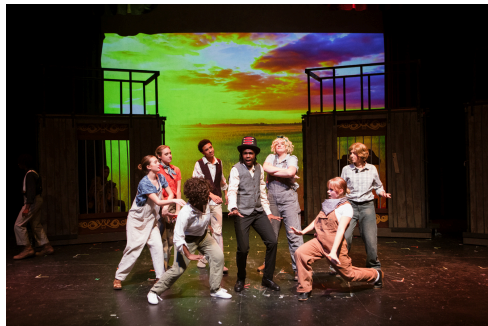
W4E songs "Easy" and "The Lion Has Got No Teeth,"